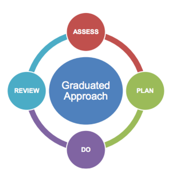
From The Local Offer